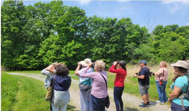
Our first Kentucky Master Naturalist cohort is off to a great start! Join us in 2025, visit our website boone.ca.uky.edu for more information!

Find us on Instagram and Facebook! @bcenvironmentaledu